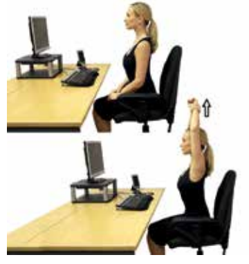
Raise both arms above your head. Hold on to one wrist as you stretch and pull upwards gently. Keep your neck straight, avoid tilting your head downwards. Repeat 2 times Hold for 20 seconds Perform both sides

The information contained in this article is intended as general guidance and information only and should not be relied upon as a basis for planning individual medical care or as a substitute for specialist medical advice in each individual case. ©Co-Kinetic 2019